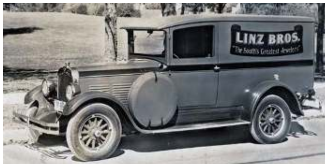
THE SOUTH'S GREATEST JEWELERS