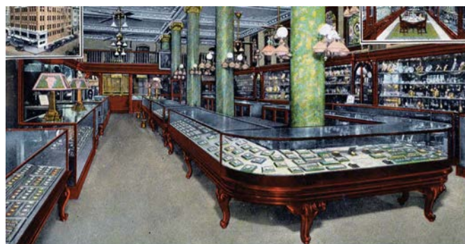
1177 RR05, DALLAS, ESTABLISHED 1877.