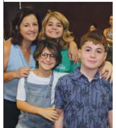
The Lomdim program at Temple, part of Youth Learning + Engagement, is a longstanding leader in inclusion.

Temple Emanu-El is committed to ensuring accessibility for individuals with disabilities. We are actively working to add more accommodations and supports to improve engagement for all Temple members. If you or a loved one could benefit from enhanced attention in this area, please contact us at inclusion@tedallas.org .