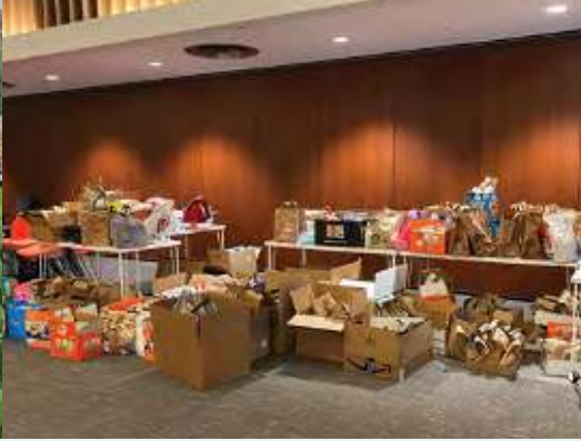
Supplies for Family Gateway during the Hanukkah drive